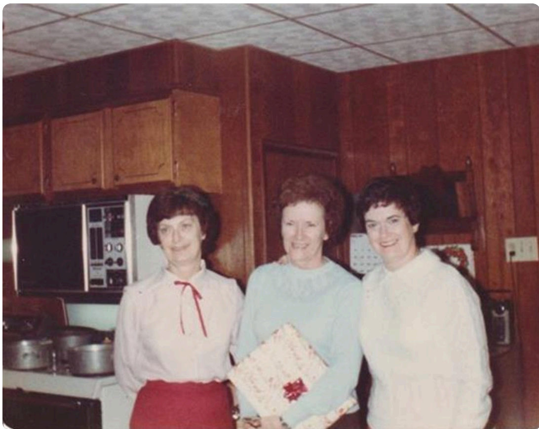
T hree Sisters